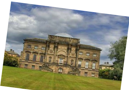
Kedleston Hall could be severely affected by the proposed development of 400 houses.

Delivered at no extra cost to the taxpayer