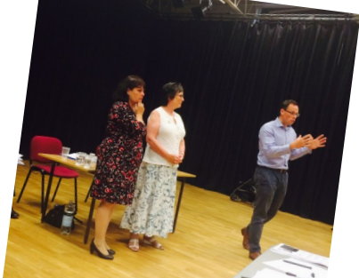
I host a public consultation at Allestree Woodlands School about the development.