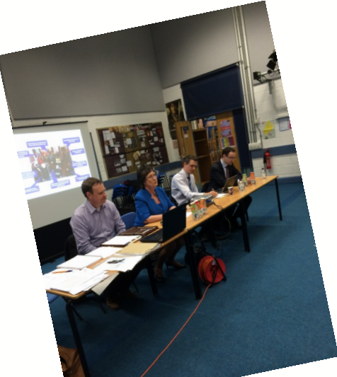
At a previous meeting, I look over the plans for the site of the old Thornton’s factory in Belper