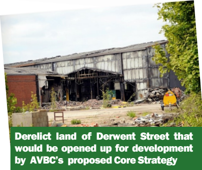
Derelict land of Derwent Street that would be opened up for development by AVBC’s proposed Core Strategy