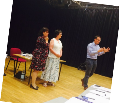
I host a public consultation at Allestree Woodlands School about the Kedleston Road Development