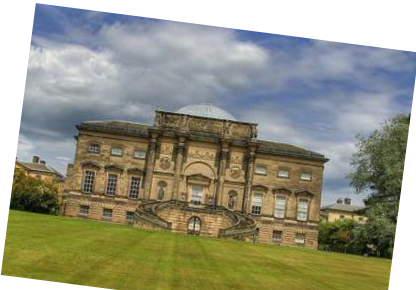
Kedleston Hall could be severely affected by the proposed development of 400 houses.

I have already submitted my objections against the Borrowash application. I believe that building on the site could have serious environmental and ecological implications. I am particularly concerned that the land designated for the development could be vulnerable to flooding, as I am informed by local people that owing to an underground spring, it could be making an existing problem even worse.